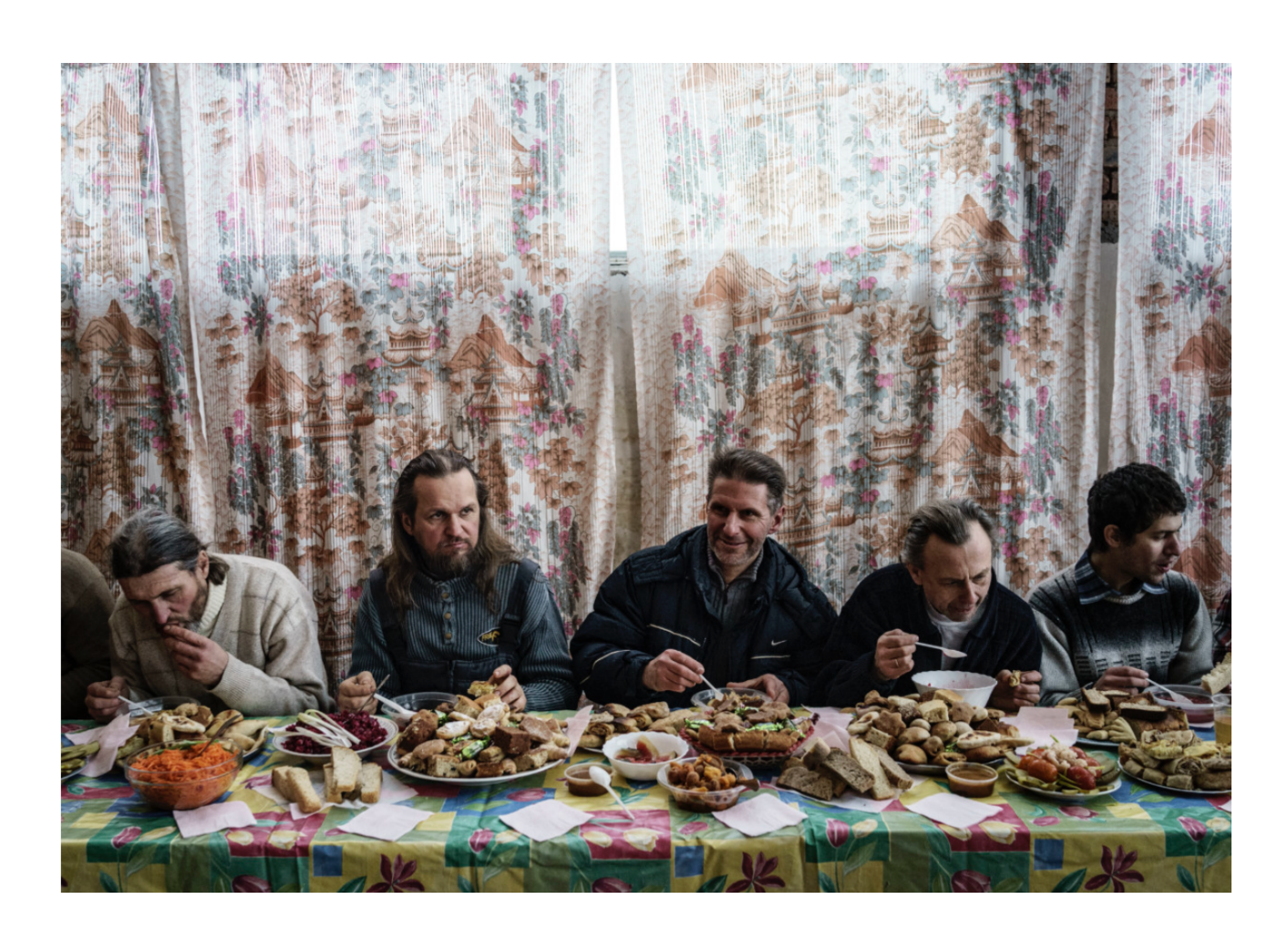
24, 25, 26 September 2019 Fondazone Giorgio Cini, Isola di San Giorgio Maggiore Venezia