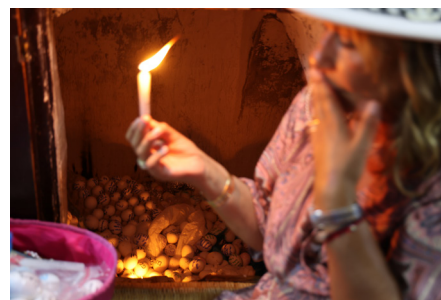
A Woman Pilgrim and Votive Eggs, 2022.

At the end of the auction, the Menara was solemnly carried in procession outside of the Ghriba. In the past and before the attacks, the procession had to pass by Hara Sghira. But since then, it has ended down the street a few dozen metres away for security reasons. The pilgrims walked as if everything was normal, but the concentration of security forces was