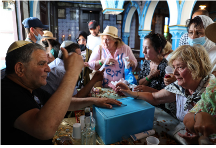
Blessing of Pilgrims in the Synagogue, 2022.