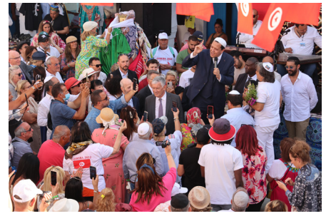
Tolerance speech of imam Hassen Chalgoumi, 2022.

From our observations, inclusive discourses advocating tolerance and