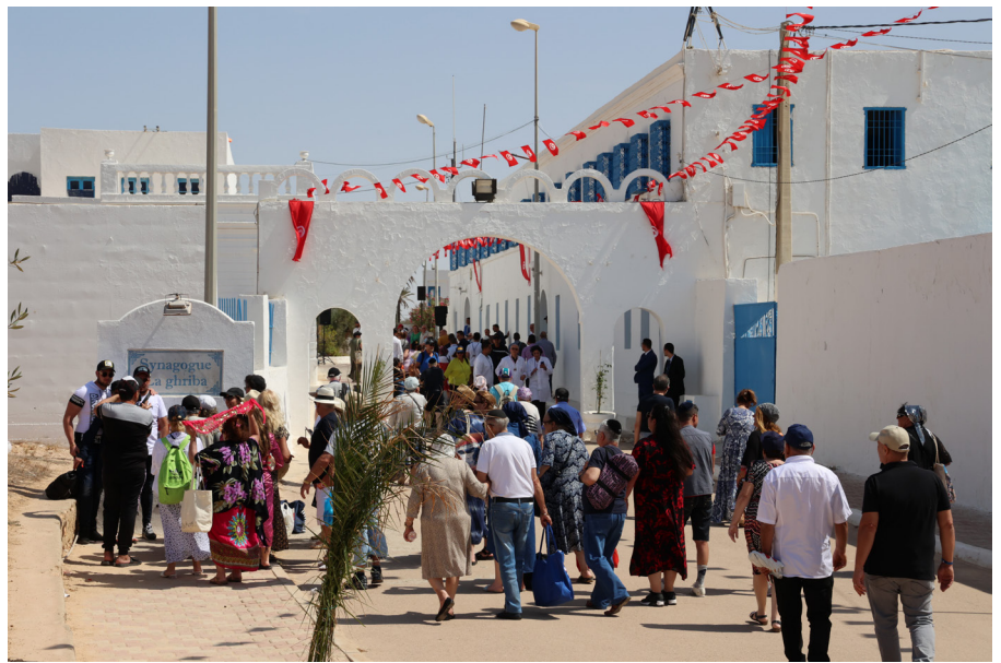
Entrance of the Ghriba Synagogue in Djerba, 2022.