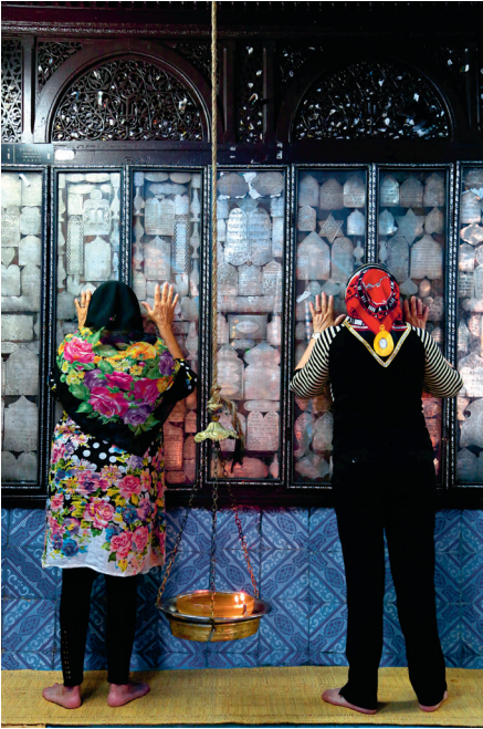
Jewish and Muslim women praying side by side, 2014.

“The Ghriba means ‘the loner’ in Arabic and in Jewish [sic]. They say it was a young girl that people found on the beach. The Muslim Tunisians said she was a girl of theirs, and the Jews here said she was a girl of theirs. So, they built a synagogue where you walk as if you were inside a mosque, with your head covered and bare feet.”