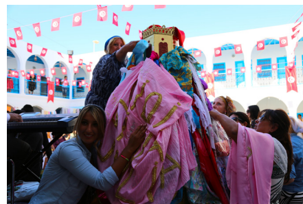
The Ghriba Menara, 2014.