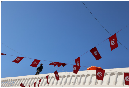
Sniper on the roof of the Ghriba Synagogue, 2022.

interreligious coexistence are conveyed “from the bottom” by the pilgrims themselves, be they Jews or Muslims. On the spot, the pilgrims willingly express their feeling of Judeo-Muslim fraternity, like this Parisian pilgrim encountered in 2014: “There is a great fraternity between Arabs and Jews. We grew up with them, we played with them, we never had any problems. Between families, we exchanged a lot of things!”; and a Moroccan Jew added spontaneously: “We were brothers and sisters! Muslims believe in the holy woman, and in her miracles, they come to deposit their eggs and they say prayers. It proves that we are connected!”