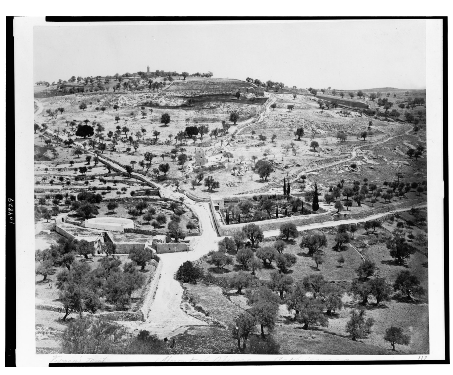
Fig. 1. Virgin's tomb, Mount of Olives, Gethsemane. Photograph © P. Bergheim, between 1860 and 1880. Mount of Olives, Jerusalem, https://www.loc.gov/item/92500668/.

Back in Jerusalem, the early Muslim development of a nucleus of sanctity with the erection of the Dome of the Rock and the Mosque of al-Aqsa did not preclude Muslims paying homage to Christian complexes.<sup>29</sup> Besides the Holy Sepulchre, the second area of interest was located east of the esplanade built over the remains of the Jewish temple. The area includes locales such as the Garden of Gethsemane, the Valley of Gehenna, and the Mount of Olives, on top of which was the Church of the Ascension (Fig. 1).