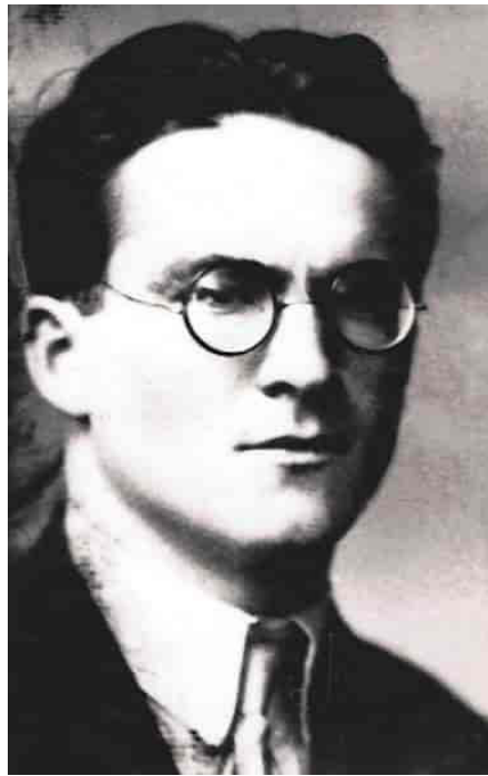
Fig. 5. Mircea Eliade, accessed August 8, 2023, https://it.wikipedia.org/wiki/Mircea_Eliade#/media/File:Mircea_Eliade_young.jpg .