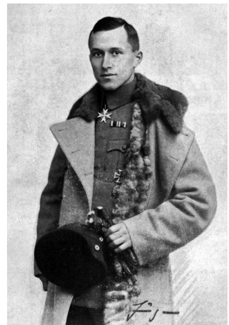
Fig. 7. Ernst Jünger, accessed August 8, 2023, https://it.wikipedia.org/wiki/Ernst_J%C3%BCnger#/media/File:Ernst_J%C3%BCnger_vers_1920_(cropped).jpg .

Hans Thomas Hakl, Eranos: An Alternative Intellectual History of the Twentieth Century (Montréal: McGill-Queen's University Press, 2012).