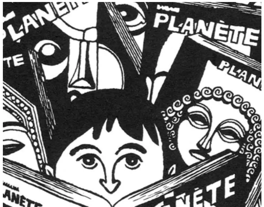
Fig. 8. David B., L'ascension du Haut Mal , detail.

In the third heterography, we have the honour of featuring the work of David B. (Fig. 8), one of the foremost comic artists, who has contributed to establishing the field of graphic novels. His works are not just comic strips, but novels with images— littérature dessinée in French. In his rich artistic production, David B. explores his biographical dramas, dreams, desires, nightmares, and fears by using esoteric and mystical symbols and narratives. As many surrealist artists before him (André Breton, Leonora Carrington, and Max Ernst, to name just a few), David B. moves between different worlds, challenging the boundaries of the secular and the religious, of reality and dreams. In the heterography he created for our journal,