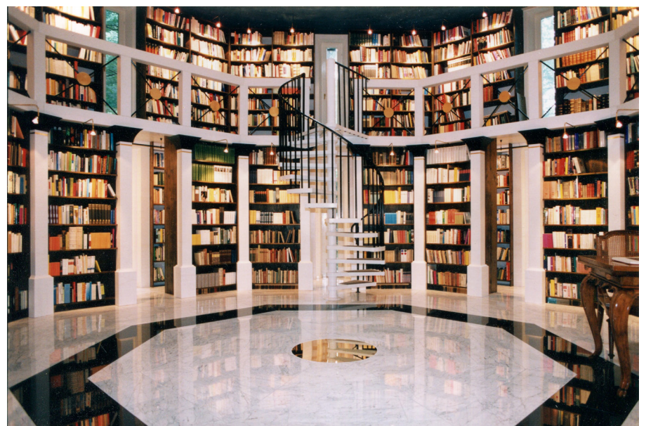
Fig. 3. Octagon Library.