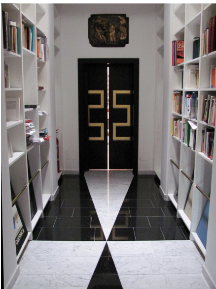
Fig. 2. Octagon Library.

This special issue is dedicated to Hakl and his collection. We consider this publication a starting point for further exploration of Hakl's library and archives. The first article by Bernd-Christian Otto describes Hakl's