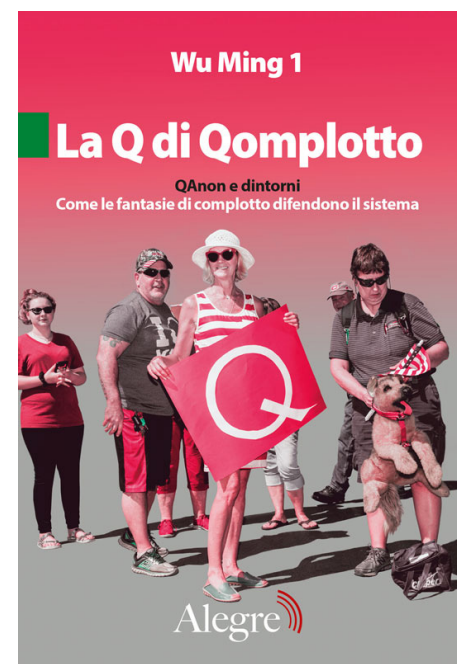
Fig. 10. Cover of La Q di Qomplotto , Wu Ming 1, 2021.

Egil Asprem and Julian Strube, New Approaches to the Study of Esotericism (Leiden–Boston: Brill, 2020).