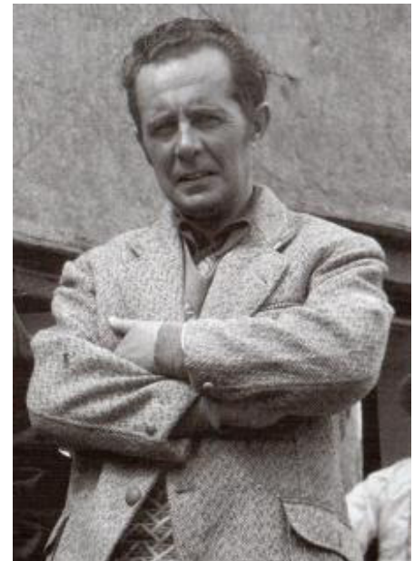
Fig. 6. Giuseppe Tucci