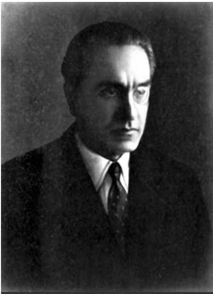
Fig. 4. Julius Evola, accessed August 8, 2023, https://commons.wikimedia.org/wiki/Category:Julius_Evola#/media/File:Evola.jpg .