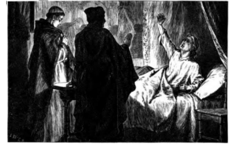
“With marble face and gasping lips the aged Maestro [Andrea del Castagno] rose in his bed and stretched his hands to heaven,” image and caption from Rosamunda the princess, and other tales by Anna Bonus Kingsford, Internet Archive, https://archive.org/details/rosamundaprince00kinggoog/page/n251/mode/2up .

The Perfect Way depicts a progress or evolution, a gradual unfoldment and growth from the lowest to the highest. Such a Hermetic process of spiritual evolution or transformation is present in her early