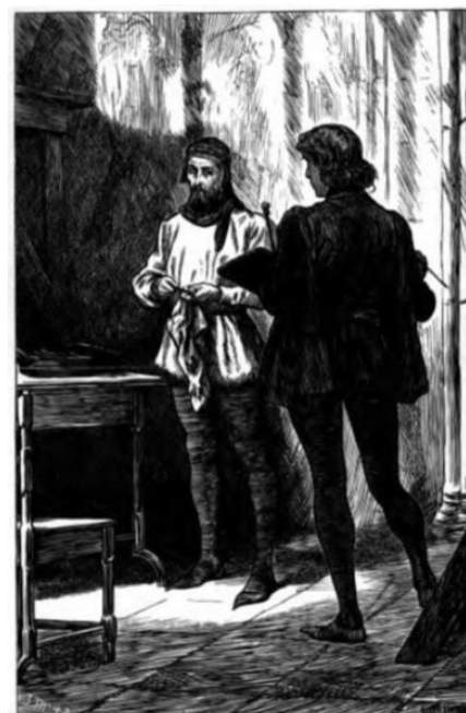
“Veneziano and Castagno, surrounded by various implements of their craft,” image and caption from Rosamunda the princess, and other tales by Anna Bonus Kingsford, Internet Archive, https://archive.org/details/rosamundaprince00kinggoog/page/n251/mode/2up .

Anna Kingsford and Edward Maitland, The Perfect Way; or, The Finding of Christ (Boston, MA: Esoteric Publishing Company, 1888), 6–10, 13–16; Anna Kingsford, “Clothed with the Sun”: Being The Book of the Illuminations , ed. Edward Maitland (London: George Redway, 1889), 16–18.