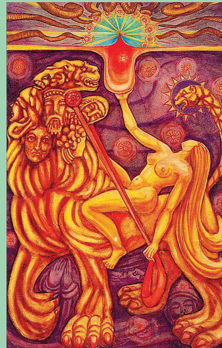
Lust from the Tarot of Thoth by Lady Frieda Harris, 1943